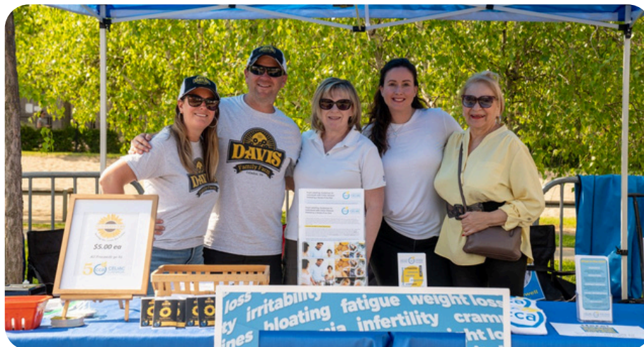
Davis Family Farm members with CCA staff at Gluten-Free Garage '23

Often, the first thing people feel after diagnosis is isolated, alone and scared. Celiac Canada steps in immediately to get people on the road to recovery with educational resources, someone to talk to and events to join in with.