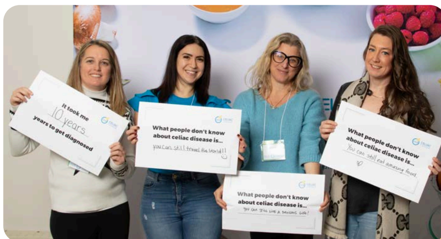
Guests at 50th anniversary launch event, April '23

“Thanks so much for initiating the State of Celiac Survey. Thanks for all you do for the celiac community and their families.”